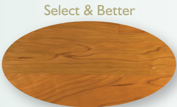
Select & Better

The luxurious tones of cherry are unparalleled in northern hardwood species. Its rich reds and browns deepen beautifully with age and feature a fine and frequently wavy grain pattern with a uniform satin-like texture. It has served for centuries as a hard, durable flooring material with warm beauty.