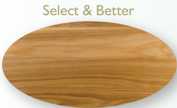
Select & Better